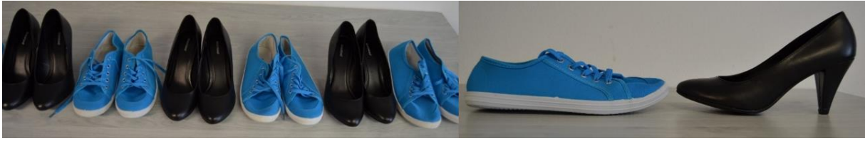
Figure 1. The high heel shoes and flat shoes used in the study

Measuring pads with 99 sensors (Pedar-X, Novel, Germany) were used to analyze the pressure distribution under the feet in contact with the ground (Figure 2). The recording frequency was 50 Hz.