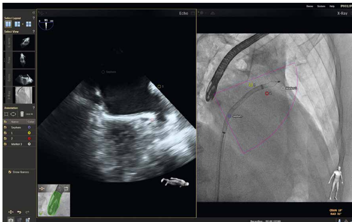
Figure 1. Intraoperative fusion image with calibrated echocardiography and fluoroscopy