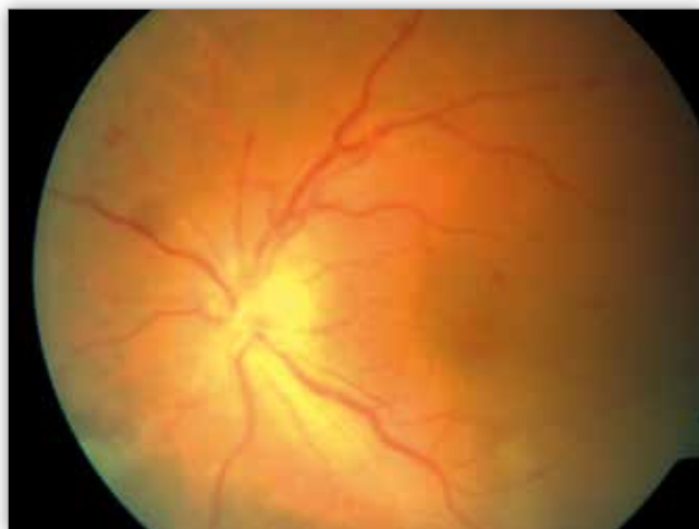
Fig. 1. The left eye fundus – papilloedema.

A 33-year-old man with irrelevant medical history was referred by the outpatient ophthalmology service to the Department of Ophthalmology at WCKJ Hospital in Jelenia Góra with clinical signs of anterior uveitis, in his left eye (LE), which was unresponsive to treatment. The symptoms had been present for two weeks and the patient had been treated with topical anti-inflammatory and antibacterial agents without improvement. On admission, the uncorrected visual acuity (UCVA, Snellen) was 1.0 and 0.3 in the right (RE) and left eye (LE), respectively, with no subsequent improvement on correction. The slit-lamp examination of RE revealed no abnormalities. In LE, the signs of anterior and posterior uveitis were observed: mutton-fat keratic precipitates, anterior chamber (AC) flare and cells and marked vitritis. The ophthalmoscopy of the LE revealed optic disc edema (Fig. 1), periarteritis (Fig. 2)