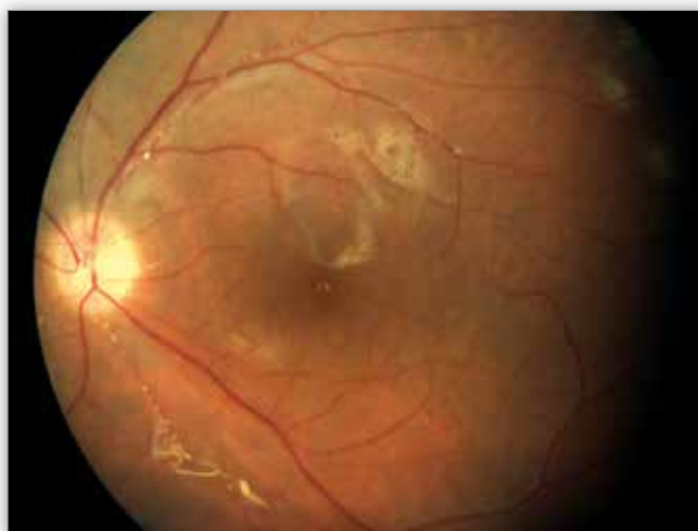
Fig. 7. 25 G pars plana vitrectomy for retinal detachment in the left eye.

Ryc. 6. Dno oka lewego – widoczne przyłożenie siatkówki po zabiegu 25 G witrektomii przez pars plana.