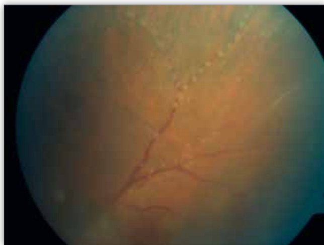
Fig. 4. The left eye fundus – gradual resolution of the optic disc oedema and regression of retinitis and vasculitis after treatment.

Ryc. 4. Dno oka lewego – po leczeniu ustępowanie obrzęku tarczy nerwu wzrokowego oraz zmian zapalnych siatkówki i naczyń krwionośnych.