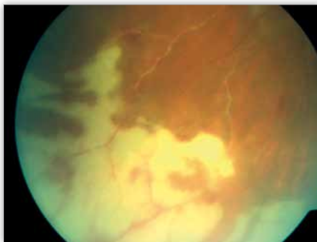
Fig. 3. The left eye fundus – confluent, creamy, sharply demarcated, circumferential infiltrates involving the retinal periphery.

Ryc. 2. Dno oka lewego – zapalenie tętnic.