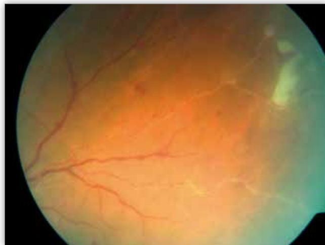
Fig. 2. The left eye fundus– periarteritis.

Ryc. 1. Dno oka lewego – obrzęk tarczy nerwu wzrokowego.