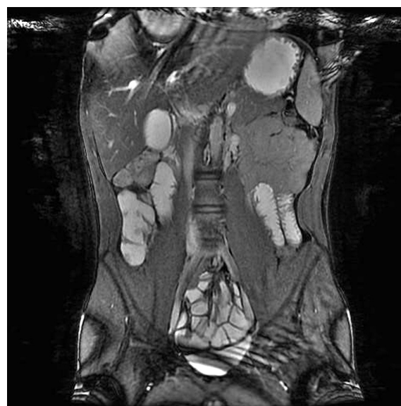
Figure 2. MR enterography study. Incorrect filling of the intestines with an oral contrast agent