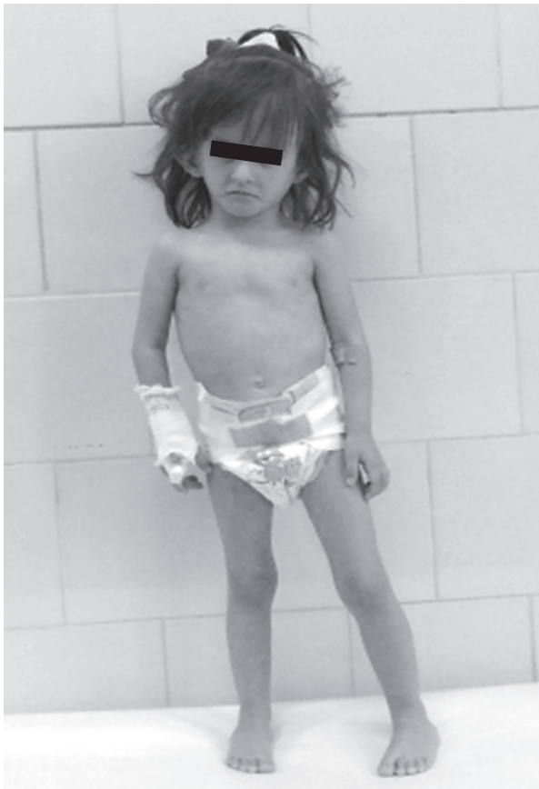
Figure 1. The photo of the patient with Silver-Russell syndrome and Turner syndrome aged 3.5 years

At the age of 2.5 growth and general development were retarded with the length of 81.2 cm (–4 SD), weight of 7.85 kg (–4.12 SD). Physical examination showed the characteristic abnormalities for SRS such as triangular-shaped face, frontal boss-