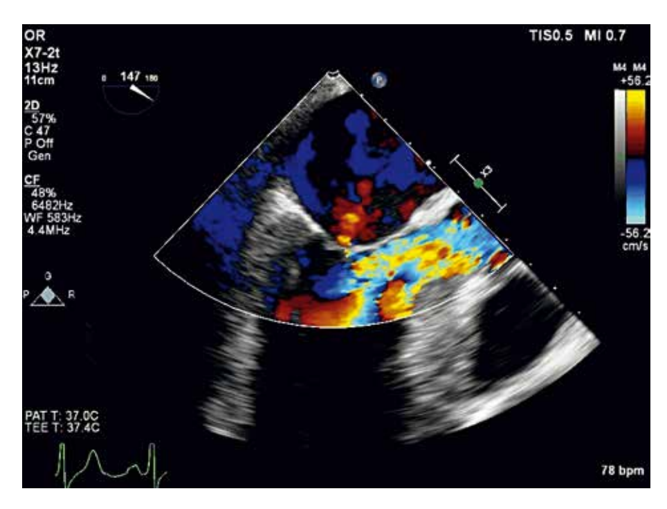
Figure 2. Picture obtained from transesophageal echocardiographic examination demonstrating LVOT after haemodynamic collapse