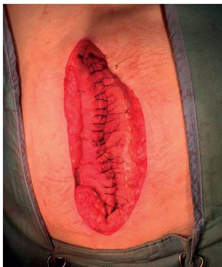
FIGURE 2. Prophylactic TIGR onlay mesh fixed by tacking on right side and suturing on left