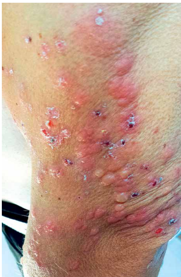
Figure 1. Yellow bullae and erythematous-edematous skin lesions on the left arm

A 57-year-old patient came to the Department of Dermatology for Adults in the Miedzyleski Specialist Hospital in Warsaw in early October 2015. The patient complained of disseminated bullous skin changes. He presented with edematous and erythematous lesions accompanied by severe pruritus. Symptoms had appeared about 3 weeks prior to admission. He was treated in an outpatient clinic with acyclovir and topical ointment containing zinc with no improvement. The patient gave a history of hypothyroidism, prostatic hypertrophy and depression. A few months earlier he moved to a new apartment where he lived with his daughter. On admission the patient presented with pruritic erythematous and edematous skin changes, erosions partially covered with crusts and tense bullae located on both lesional and non-lesional skin of the trunk and upper and lower extremities. Some of the skin changes had a linear arrangement, while others were grouped (Fig. 1). Face, scalp and mucous membranes were free of lesions. Laboratory examinations showed elevated levels of erythrocyte sedimentation rate (ESR), D-dimer, uric acid, total cholesterol and IgE in the serum. A slightly elevated number of eosinophils was present in the blood smear. Bullous pemphigoid was suspected. Direct and indirect immunofluorescence tests were negative. We also performed histopatho-