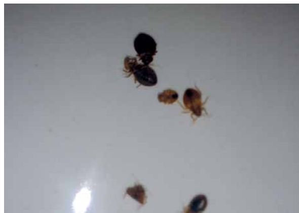
Figure 3. Picture of the bed bugs

A woman aged 34 in good general condition attended the Department of Dermatology for Adults in Miedzyleski Specialist Hospital in Warsaw in late October 2015. On admission the patient complained of itchy erythematous and edematous lesions and vesicles in the area of the neck, buttocks, thighs and arms (Fig. 4). These symptoms appeared about 4 weeks prior to admission. The patient lived with her father in a new flat. Laboratory tests showed a slightly elevated level of indirect bilirubin in the serum. Other values were within the normal limits. Direct and indirect immunofluorescence tests were negative. After detailed history taking, insect bite reaction was suspected. The patient was treated with a topical corticosteroid with good results. She did not come for a checkup in the outpatient clinic. Her father informed of complete resolution of symptoms in his daughter.