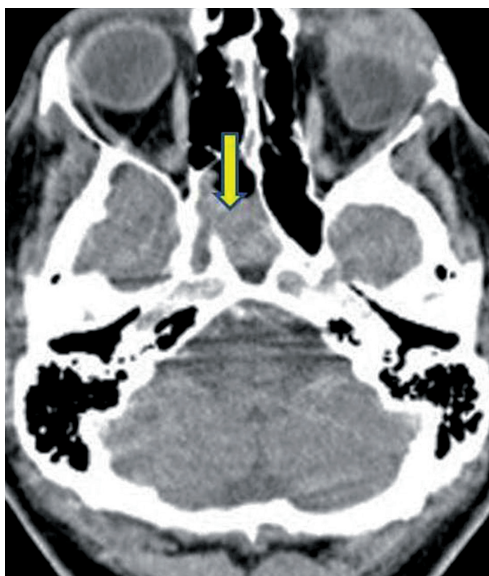
FIGURE 3. CT scan of the nasopharynx and neck showing a mass at the nasopharynx (arrow mark)