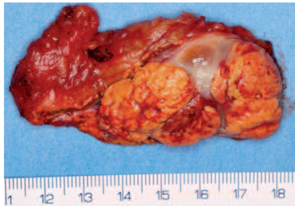
Photo 4. Adrenal gland with metastasis of clear cell renal cell carcinoma. On the left side of the specimen, the rest of the normal adrenal gland is visible

In the classical description of a radical nephrectomy for RCC, Robson and colleagues suggested that adrenalectomy should be performed as an integral