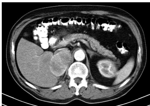
Photo 1 Extensive renal cell carcinoma metastasis into the right adrenal gland, the state after transperitoneal radical nephrectomy on the right in another department 5 years ago. The patient was indicated for open adrenalectomy

The technique of LA is well described and may be performed using a transperitoneal or retroperitoneal approach [4]. However, the retroperitoneum is obliterated in patients who have undergone nephrectomy. Therefore, a lateral transperitoneal approach is used for all the patients with PIN.