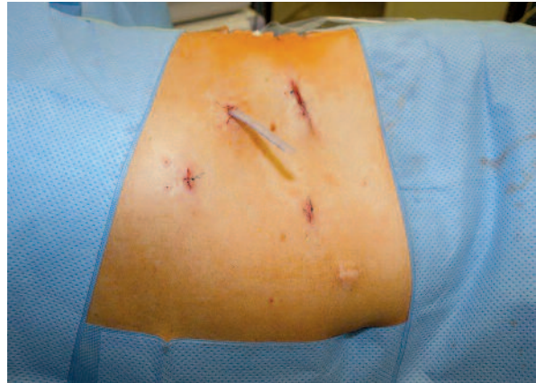
Photo 3. View of the abdominal wall following laparoscopic adrenalectomy on the left. The scar after previous laparoscopic nephrectomy used for extraction of the specimen

The group comprised 4 men (80%) and 1 woman (20%). The mean age at the time of surgery was 66.8 ±8.5 (range: 60-77 years).