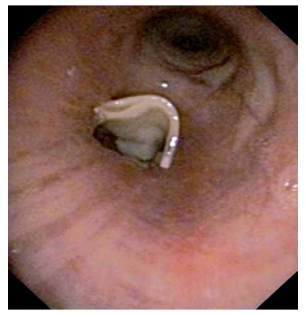
Photo 1. Proximal part with the falling petal valve of the rubber endobronchial prosthesis is seen, while its distal cylindrical part is implanted in the affected upper segment of the left lower lobe (patient 10)

Palmen et al. [8] showed that VAC treatment of recurrent empyema in the presence of the residual lung tissue with or without alveolopleural fistula achieved spontaneous OWT closure through the acceleration of tissue granulation. There was such