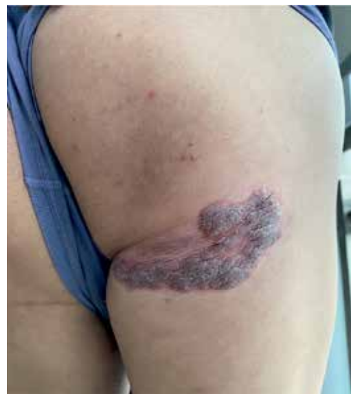
Figure 1. A hyperkeratotic plaque on the dorsal proximal right thigh, along with three red nodules on the right hip

Histopathologic findings are contingent upon the lesion's duration. During the early months, a non-specific