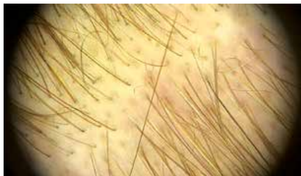
Figure 2. Androgenetic alopecia in a man. The temporal hair loss. Trichoscopy, 20× zoom, Department of Dermatology, Katowice