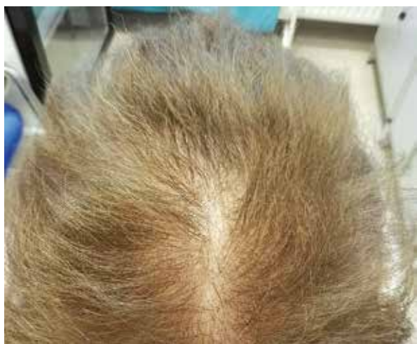
Figure 3. Androgenetic alopecia in a woman, Olsen type. Department of Dermatology, Katowice