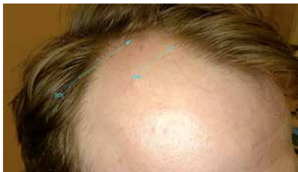
Figure 1. Androgenetic alopecia in a man. The temporal hair loss. Department of Dermatology, Katowice