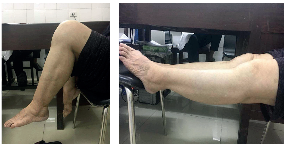
Figure 3. Five-year postoperative range of motion of a patient: maximum flexion was 95° and full knee extension

knee score: 91.3 \pm 10.7), but the worst result was for the combination of diabetes and obesity. As for the ROM, no significant difference was found between patients with and without diabetes. Thus, older age, diabetes, reduced rehabilitation procedures, and overweight negatively affect the outcomes and the knee function; also, the last two factors affect the ROM value (Figure 3).