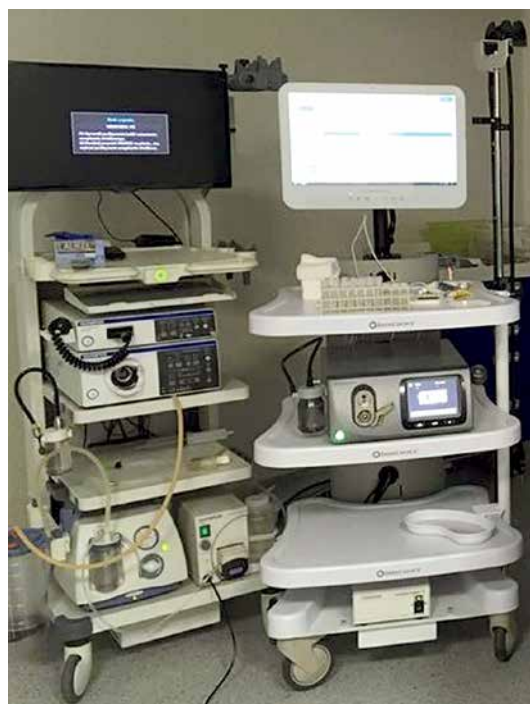
Figure 2. Olympus Evis Exera III tower (left) and FUSE tower (right)

The materials acquired in this study were systematised and analysed, and variable distri-