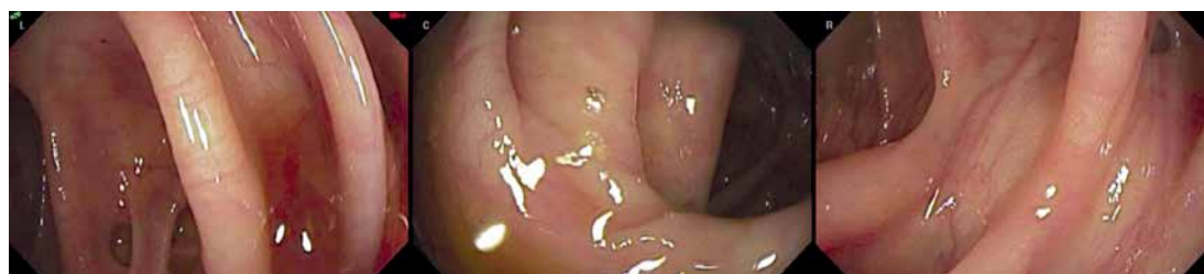
Figure 3. FUSE endoscopy display. The full-spectrum endoscopy (FUSE) helps to visualise the proximal sides of the haustral folds

In total 209 patients were examined with SFV and 199 with FUSE endoscopes. The mean age of patients was 64.3 years (SD \pm 11.67 years). Both groups were comparable in terms of sex ( p = 0.412 ), age, and BMI ( p = 0.198 ) and the preparation of individual colonic regions. Patient characteristics are presented in Table I. All patients completed the study, and the success rates of caecal intubation